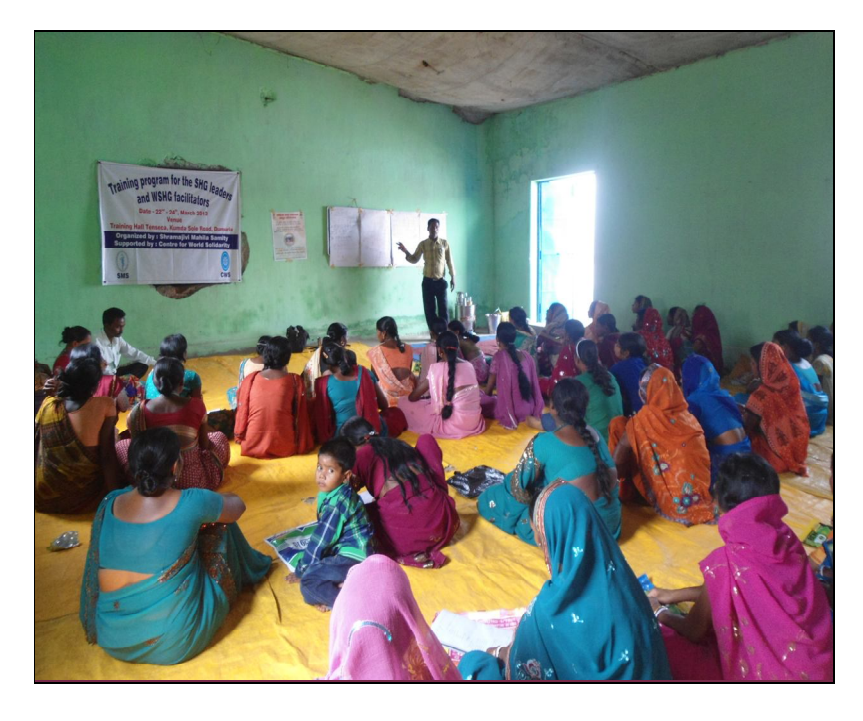
A training program for the SHG leaders

Formation of new SHGs are going on along with the opening of their account in the bank. The members of SHGs are doing their own savings and also getting the credit linkage from the bank. Through different training programmes they are made strong for application generation for bank linkage and record keeping.