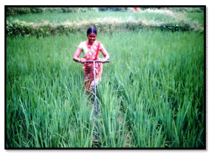
A woman doing Rice Production by SRI