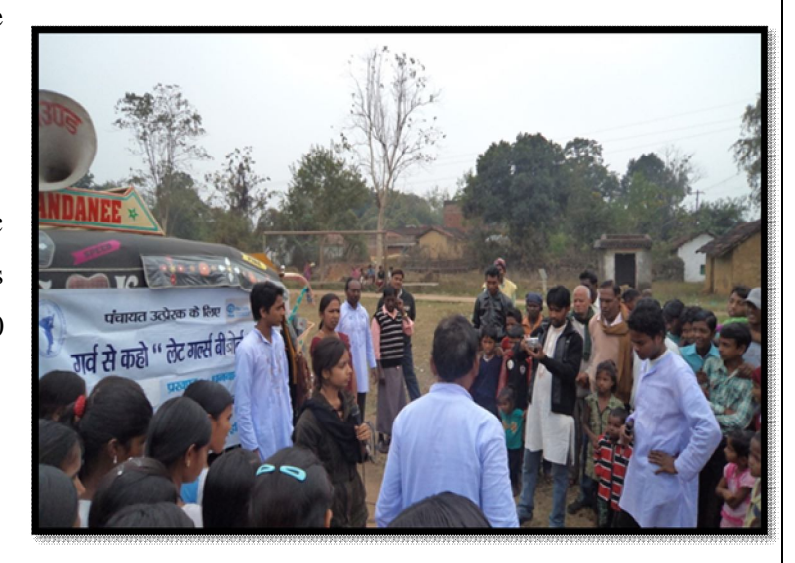
Villagers watching the Street Play

36 Street plays organized in the strategic locations so that the information is disseminated on larger forum. 7200 community people saw the street play.