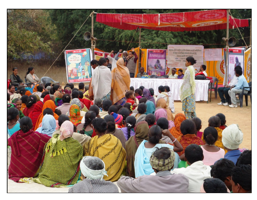
Public hearing on MNGRA at Chaibasa,