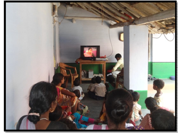
Women and children watching the videos.

New programme was initiated from December-2011 to October-2012. During the period of March -12 to October-12, total 1380 video shows are targeted and achieved. Out of 17135 targeted audience of 60 villages, 10205 have seen the shows in which 3545 were new audience. During the video show the cluster coordinators facilitate the