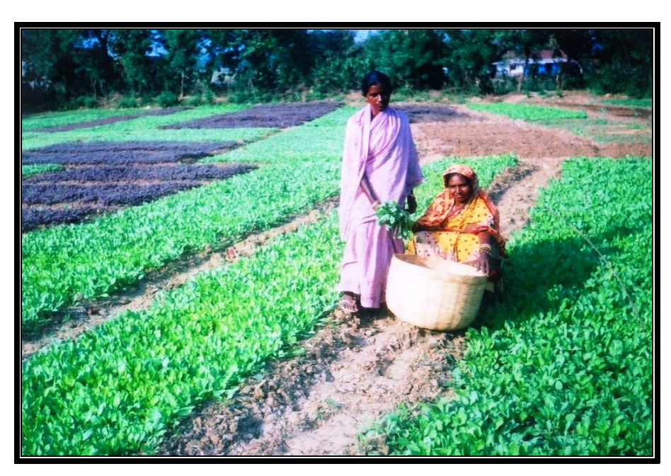
Woman utilizing the backyard land for vegetation