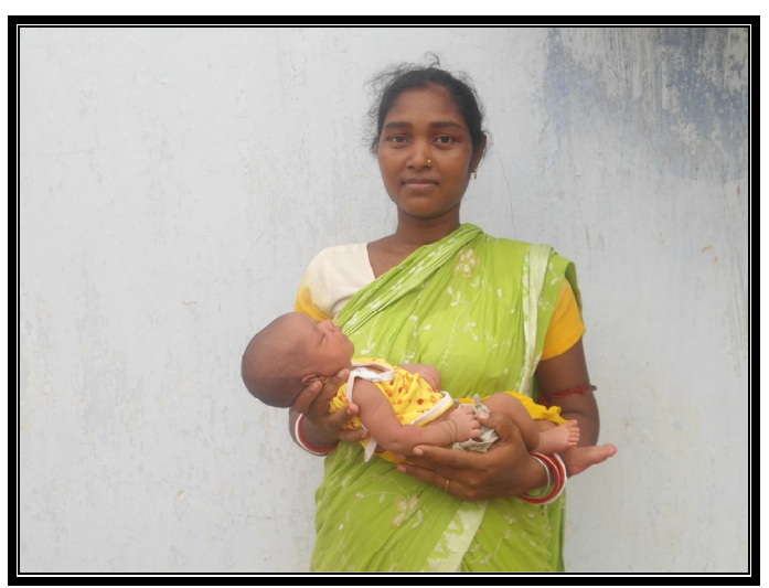
Healthy mother for healthy child

The programme became very effective in all the respective villages. Peoples have gain more and more knowledge on mother and child health issues through this programme. It's a good tool for conducting IPC with the target audiences on mother and child health issues. The format of pre and post test analysis shows it that how much knowledge have been increased among the target audiences. FFL video's great impact were also affected the pulse polio round in Dumuria block polio immunization's coverage have been also increased through the FFL video. It was fruitful for the project staffs also they have also gain more information on mother and child health issues and BCC/IPC by regular conducting the sessions.